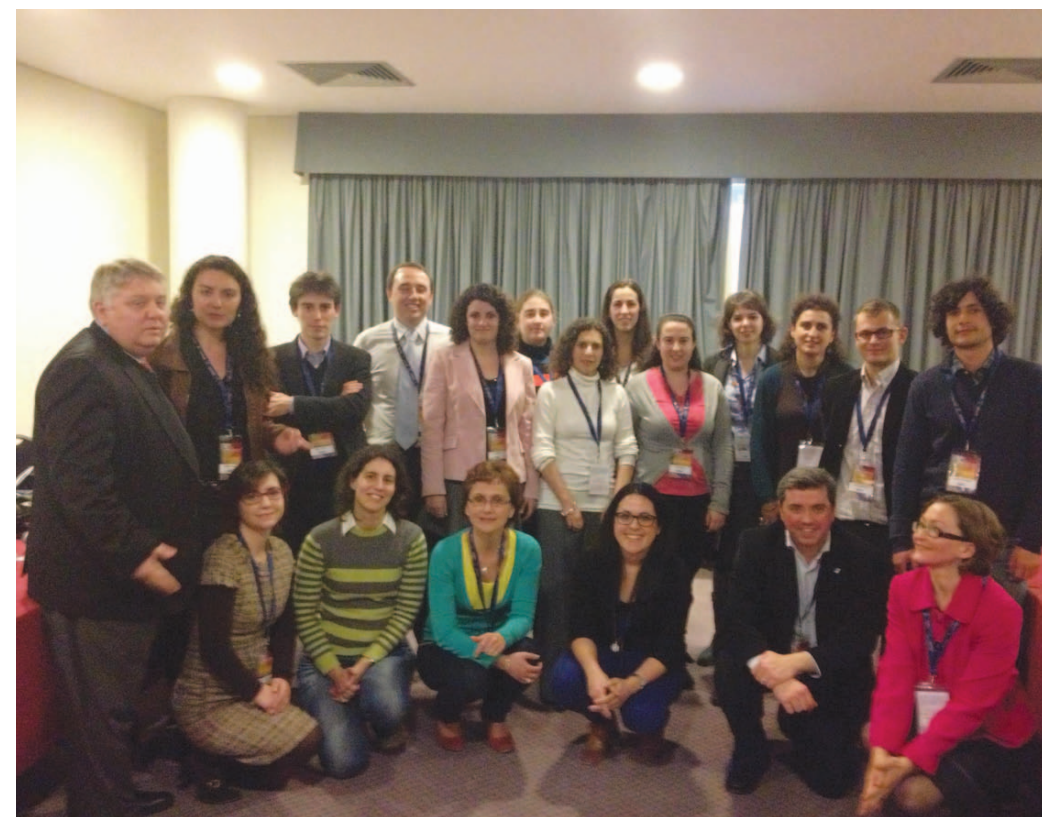
Feb 2013 - Mini Hippokrates at Aveiro