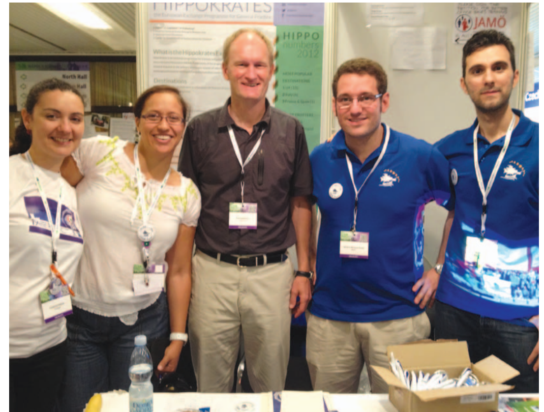
June 2013 – WONCA World, Prague

We must not close ourselves into our little cocoon, no we will degenerate into a closed mind of pitiful self-centeredness whining in self-defense – can you hear those tones among yourselves and colleagues? “We are not getting the respect we deserve”, “Family