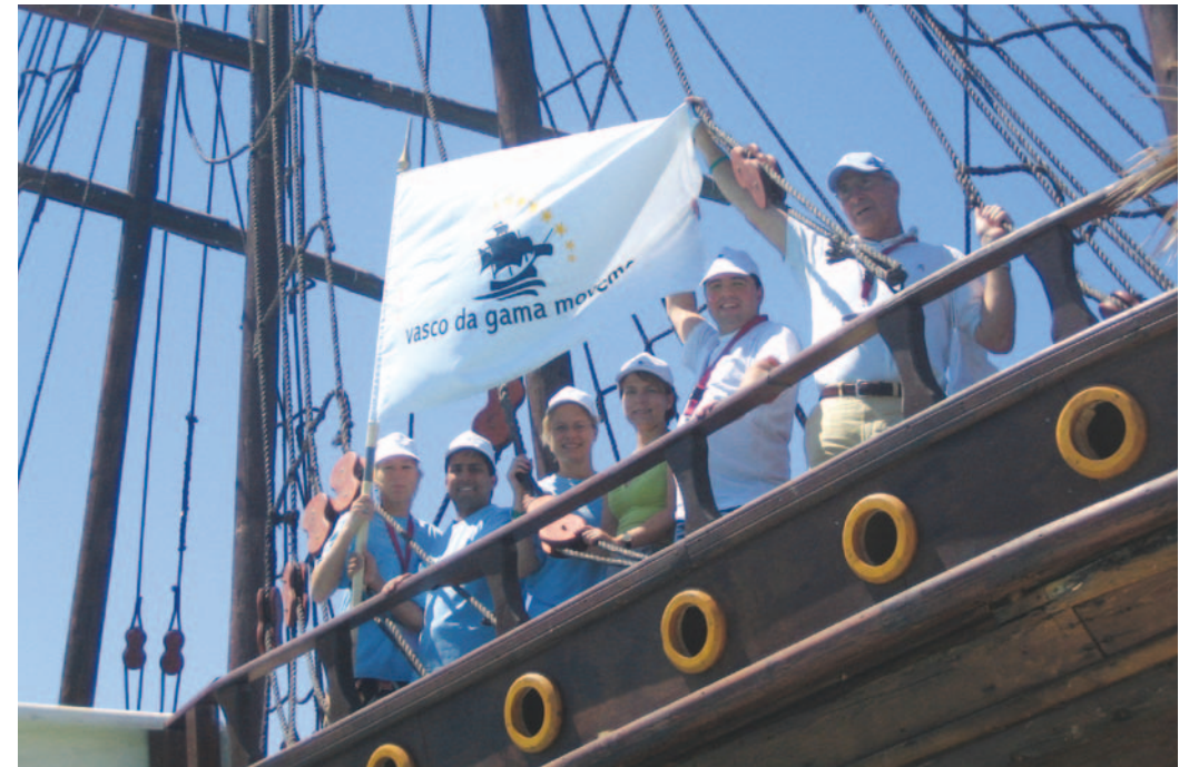
2005, Kos - the VdGM in during the 11th WONCA Europe Conference

The influence of VdGM also became more relevant because of several sessions the group presented, reflecting the work of the pre-conference. In the homeland of Hippocrates, VdGM celebrated its first anniversary with awareness of its responsibility for future steps.